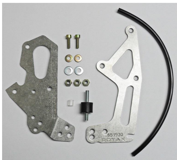
Figure 1.2: New Support Plate (Part No. 481 257) to suit 125 MAX EVO Engines.