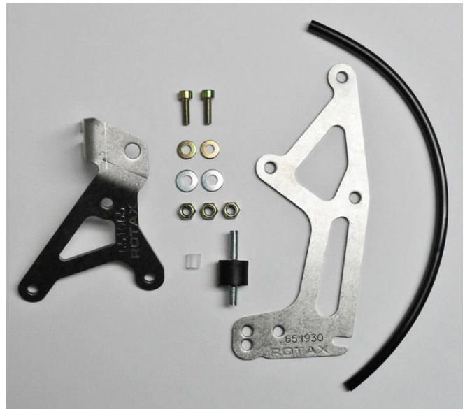
Figure 1.2: New Support Plate (Part No. 481 259) to suit 125 DD2 MAX EVO Engines.