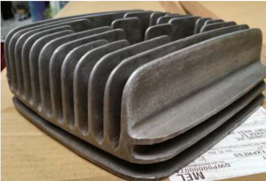
SAND CAST/ PERMANENT MOULD